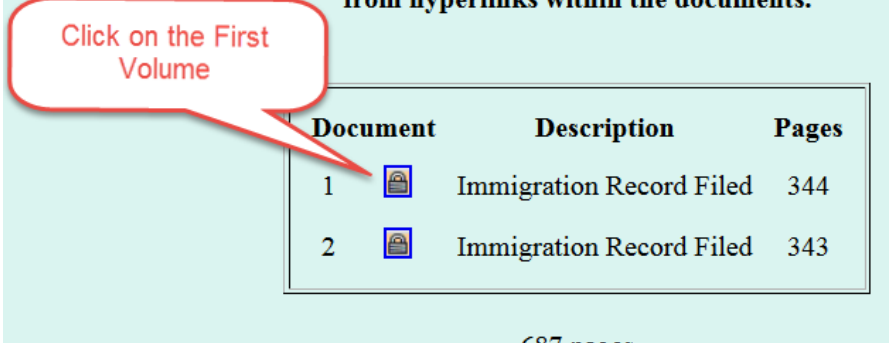
687 pages Cannot combine all documents (exceeds max of 20 MB)

To view the main document and its attachments without incurring a PACER fee, click on the hyperlinks displayed on this menu. You will incur a PACER fee to view CM/ECF documents from hyperlinks within the documents.